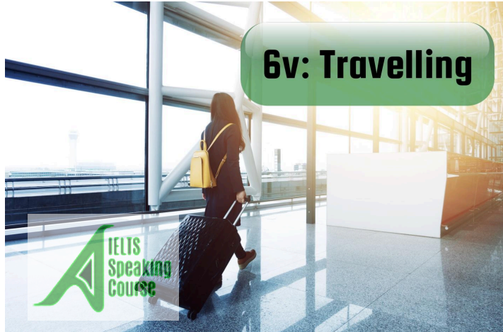
Lesson 1B: Yes/No Questions (2)