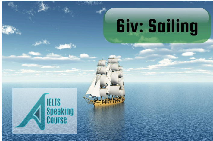
Lesson 1B: Yes/No Questions (2)